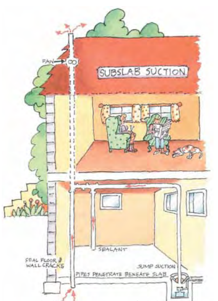
Note: This diagram is a composite view of several mitigation options. The typical mitigation system usually has only one pipe penetration through the basement floor; the pipe may also be installed on the outside ohe house.

include a monitor that will indicate whether the system is operating properly. In addition, it's a good idea to retest your home every two years to be sure radon levels remain low.